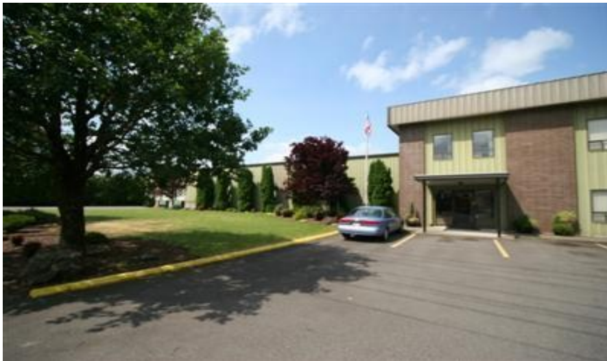
123 Habein Road